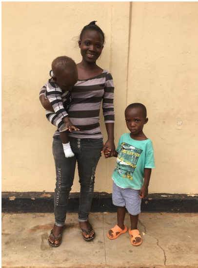
wakisa girls with her baby visiting