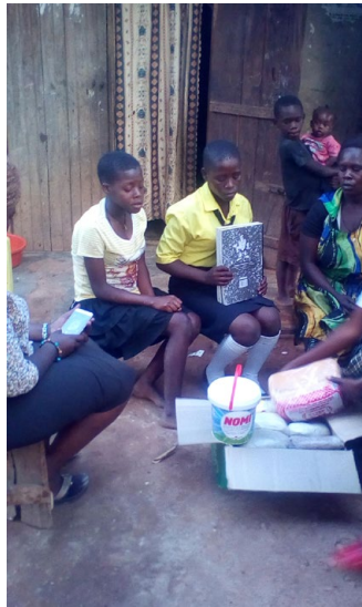
Home of the youngest girl at the center currently