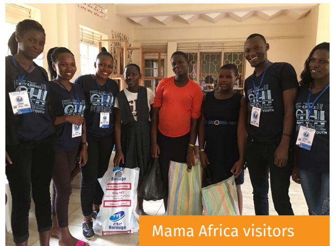
Mama Africa visitors