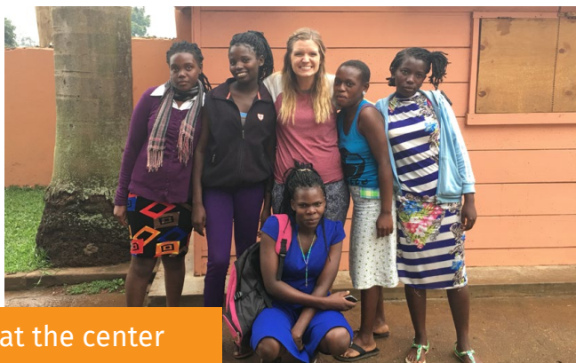
visitors at the center