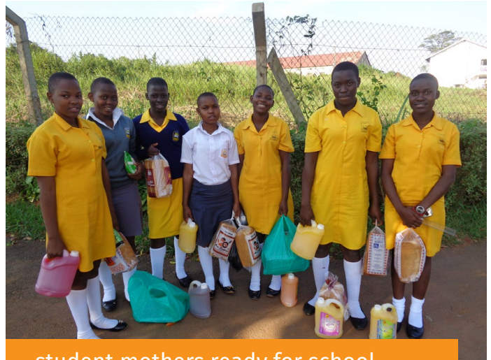
student mothers ready for school

The literacy classes have boosted confidence and self-esteem through debates held and the girls are clearly learning to express themselves better. The debate motion this month was "Boarding school are better than day schools"