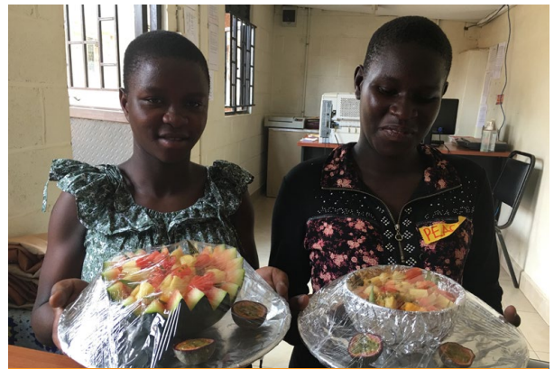
the girls learning fruit presentation