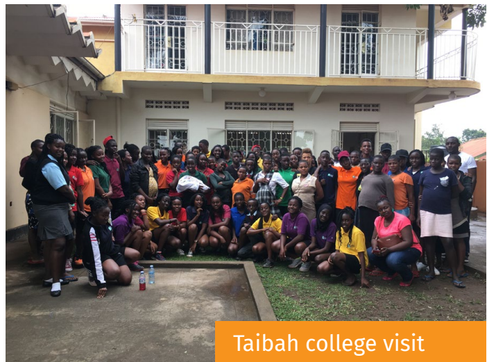
Taibah college visit

May the living God continue to bless you as you bless the vulnerable girl child and the babies of these young mothers. Thanking you for your love and commitment.