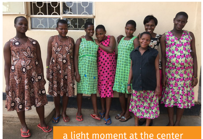
a light moment at the center