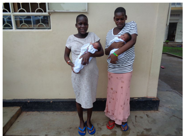
new babies at the center