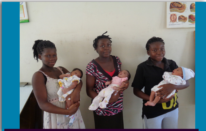
THE GIRLS WITH THIER NEW BORN

There are 20 girls out of 26 who have accepted Christ as their Lord and Saviour and so the staff and counsellor have started the journey of faith with these girls during their time at Wakisa .