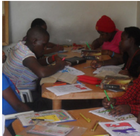
BIBLE STUDY CLASS

Please pray for the 5 girls who are about to sit for their examinations for senior 4 and senior 6.