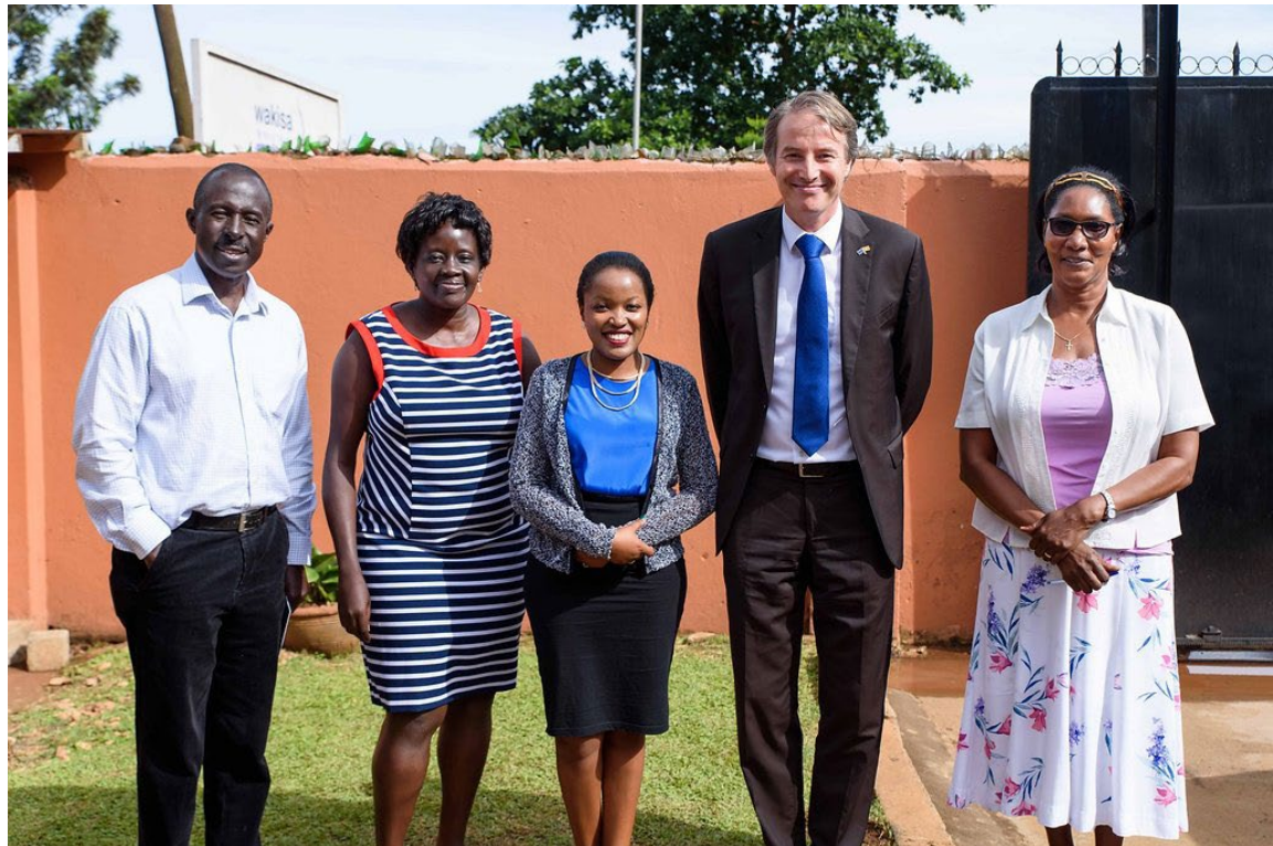
The Ambassador with the; Director, Center Manager and Member of the Wakisa Board

The promotion of dignity and self esteem of teenage girls in Uganda with crisis pregnancy while addressing their emotional, physical and spiritual well being. This is achieved by providing temporary shelter, counselling and care services.