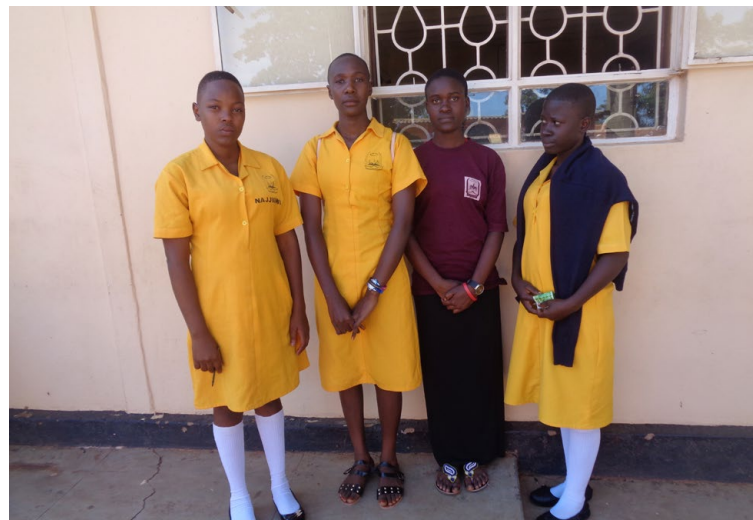
some of the teenage mums sponsored by Wakisa ministries