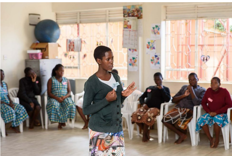
Resty, 15 years 4 month pregnant presenting her story