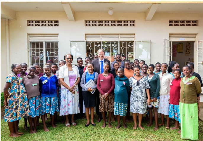
The ambassador with pregnant teenage girls at Wakisa ministries