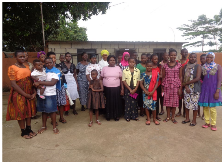
Parent Student meeting at Wakisa