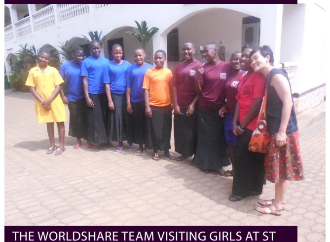
THE WORLDSHARE TEAM VISITING GIRLS AT ST MICHEAL

The Buloba High school girls and the Namirembe Infant girl are soon going back.