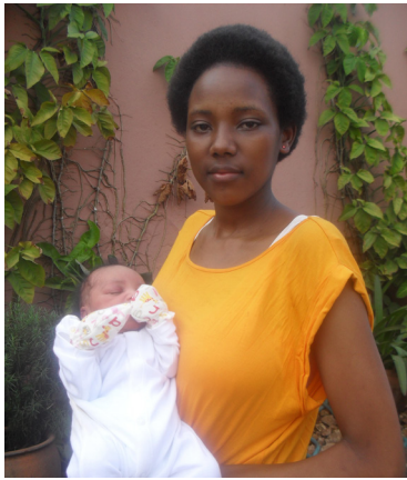
QUEEN WITH HER BABY BOY