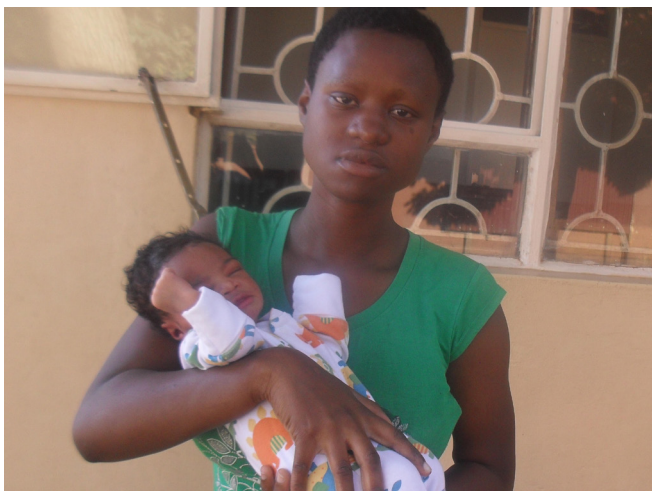
SHAKIRA WITH HER BABY