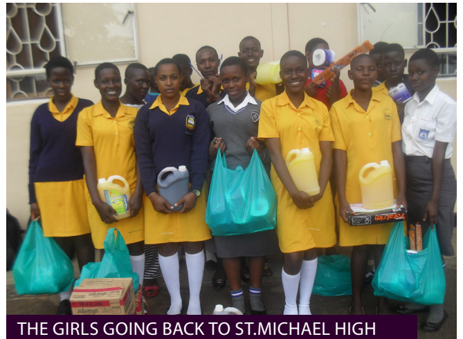
THE GIRLS GOING BACK TO ST.MICHAEL HIGH SCHOOL