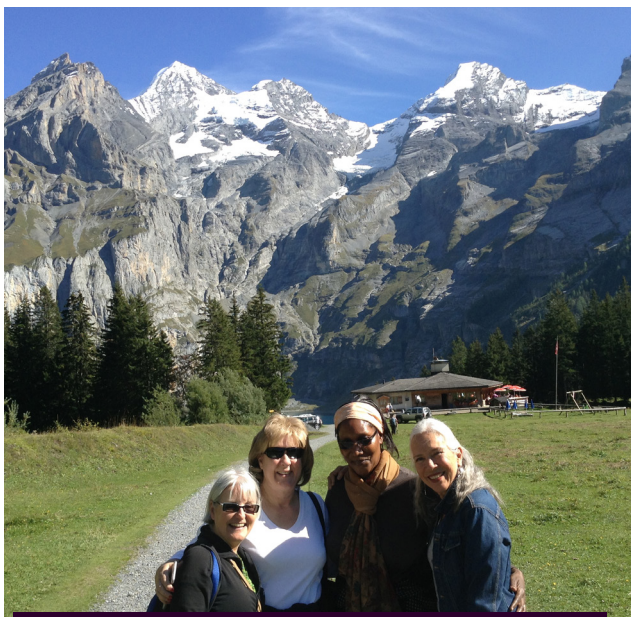
MY TRIP TO THE SWISS ALPS