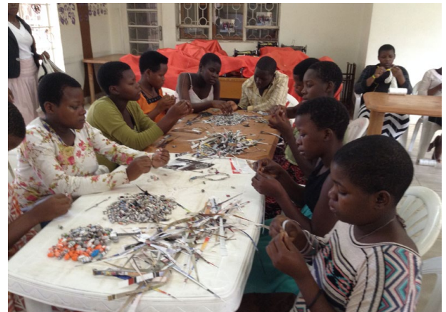
making paper beads

The cookery class has been focused around vegetables this has been; salad making, vegetable steaming and cooking.