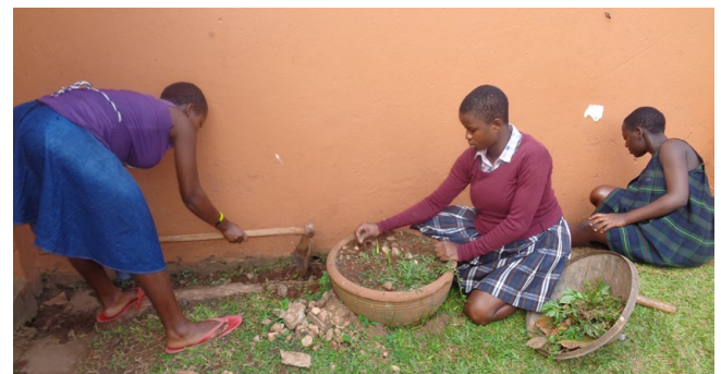
some cleaning at the center