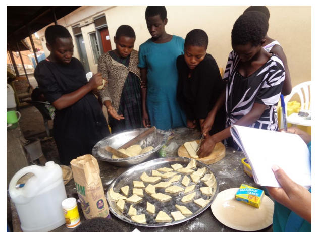
catering class preparations