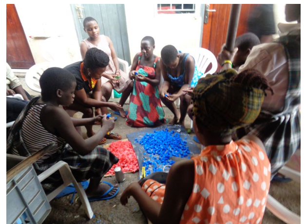
candle making class