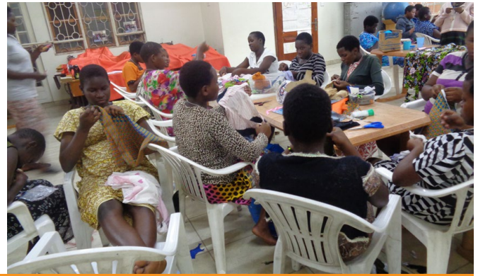
a light moment during a class at the center

As always the new girls have been oriented into the life at Wakisa, they received counselling and antenatal visits and ultra sound scanning. They have joined the classes and have integrated well.