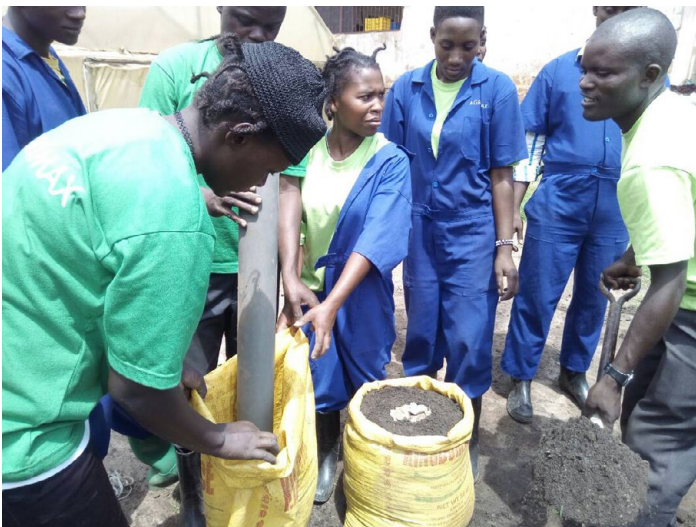
girls at Agromax