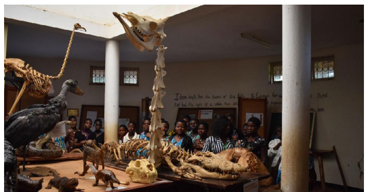
Visit to the zoo