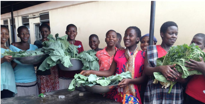
girls practicing agriculture

The rainy season has enabled us to have practical lessons in Agriculture and it has benefited the Agromax Institute where some Wakisa young mothers are undergoing training in Agriculture .