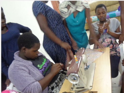
Tailoring by the girls