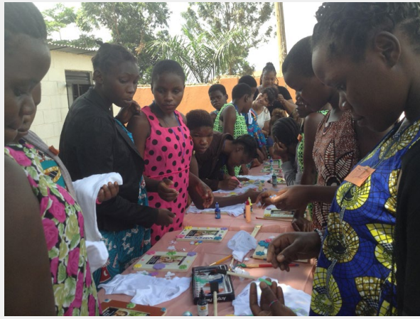
girls painting baby tshirts