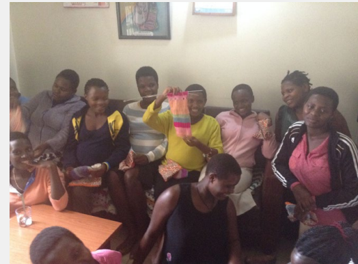
a light moment during knitting