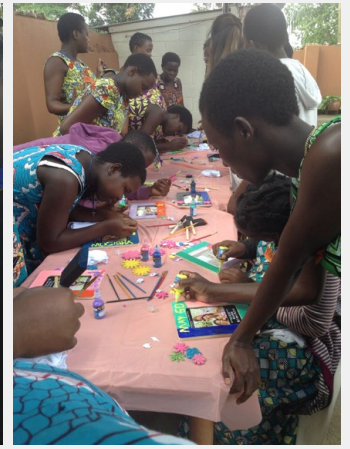
and making photo frames