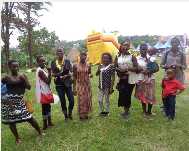
A group of girls with their children