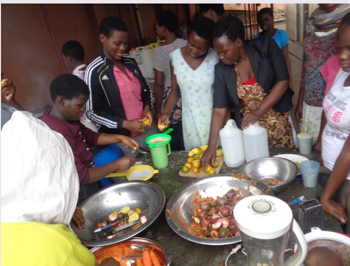
girls making juice during cookery class