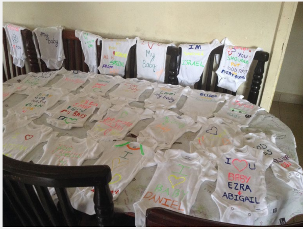
some of the products of the crafts class