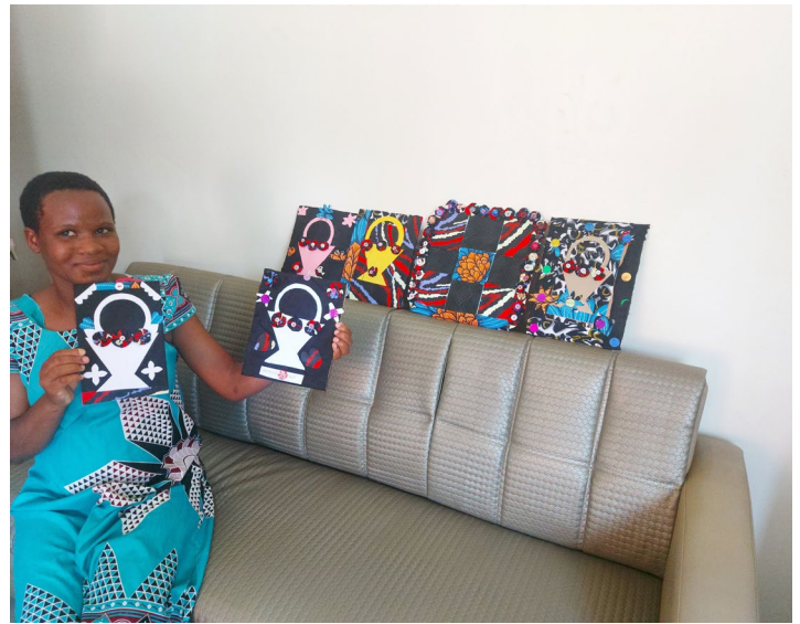
some artworks made at the center

No sooner had the schools started than they broke off for a short holiday. This left a lot of take-away homework for students which they brought to do at home. The next semester is due 8th May 2022.