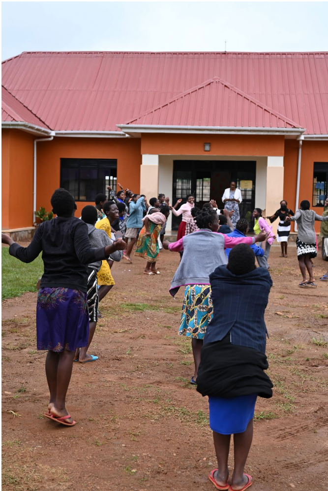
girls exercising at the center

4 young pregnant girls were admitted at the centre and they have been oriented and are settling in well. We now have two 13 years old, and one is HIV positive. Please include her in your prayers. 9 young mothers were resettled with their families and will be followed up as they resettle back home for a year.