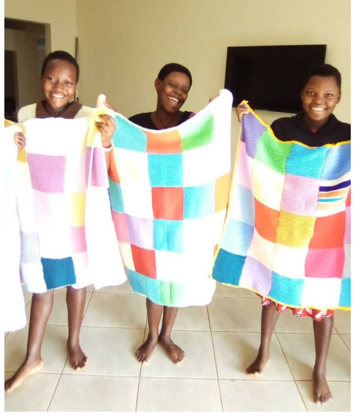
the girls with some of the blankets made