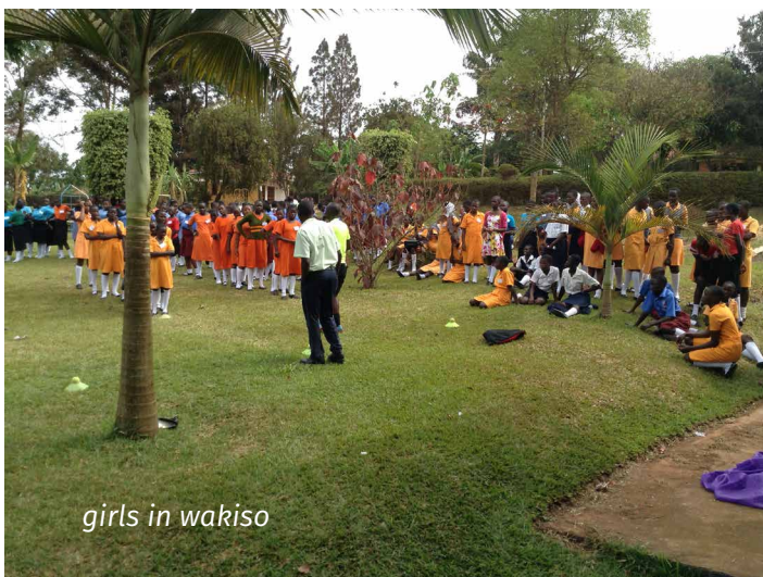
girls in wakiso

The center received a recognition for the work done in Community transformation from NSSF Uganda.