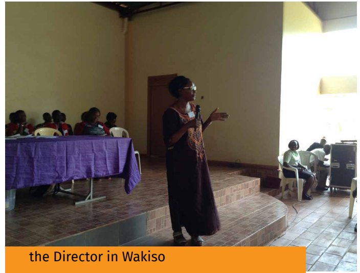
the Director in Wakiso