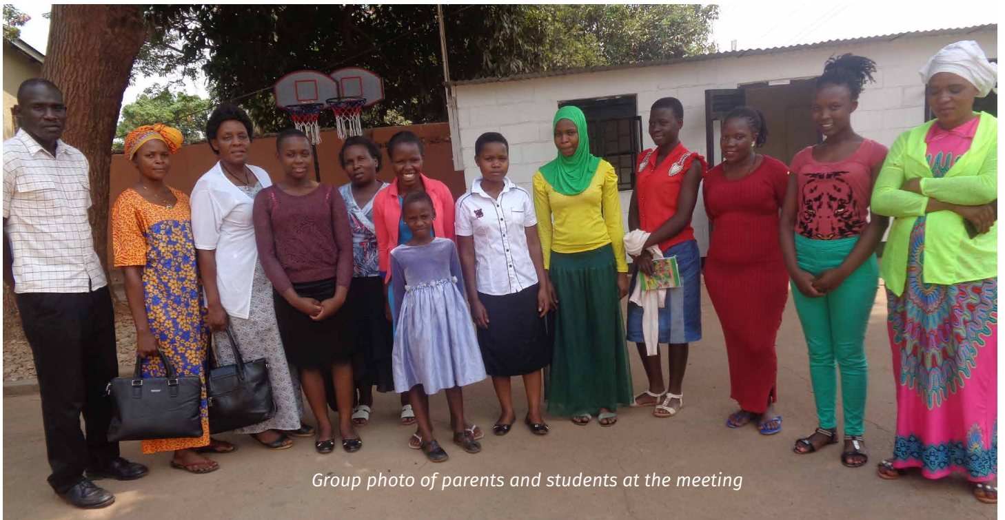
Group photo of parents and students at the meeting

We have 21 girls in formal education and 10 girls at a Vocational institution. Before schools opened in early February, we had a Student - Parents meeting with a theme “Staying in School and Purity”