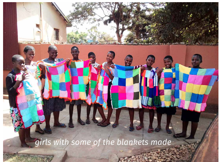
girls with some of the blankets made