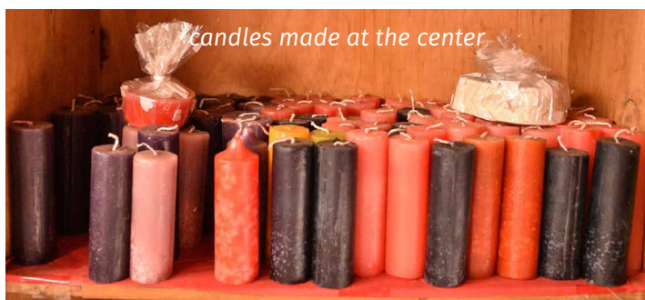
candles made at the center