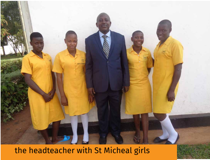
the headteacher with St Micheal girls