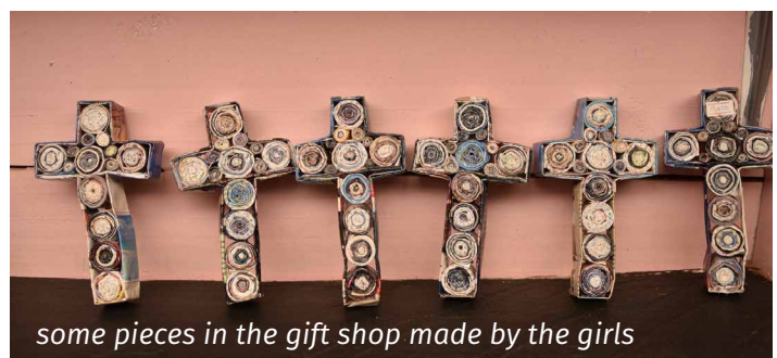
some pieces in the gift shop made by the girls