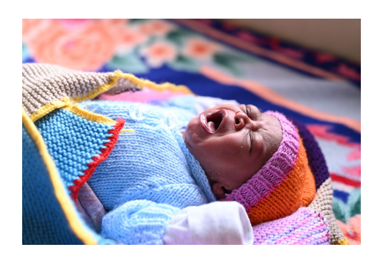
Meet the Team

We had 10 admissions. The new girls were assessed and isolated from other girls. We discharged 2 young mothers.