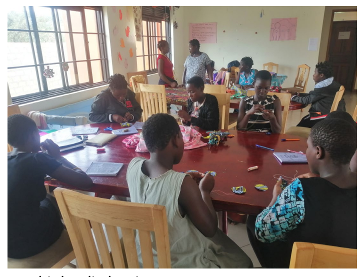
girls in tailoring theory