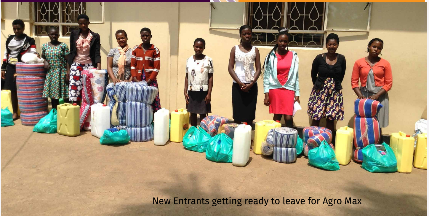
New Entrants getting ready to leave for Agro Max