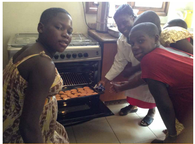
cookery class using the new cooker