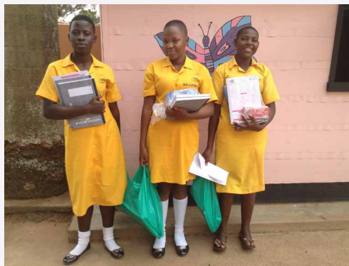
Young sponsored mothers going back to school