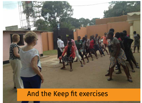
And the Keep fit exercises