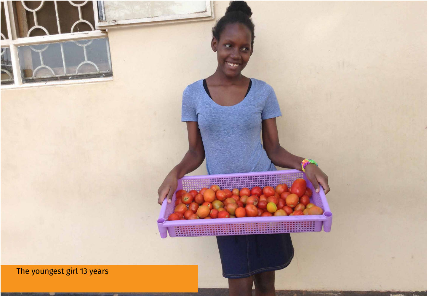
The youngest girl 13 years