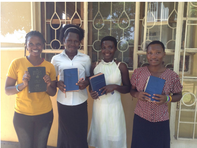
some of the girls from morning devotion