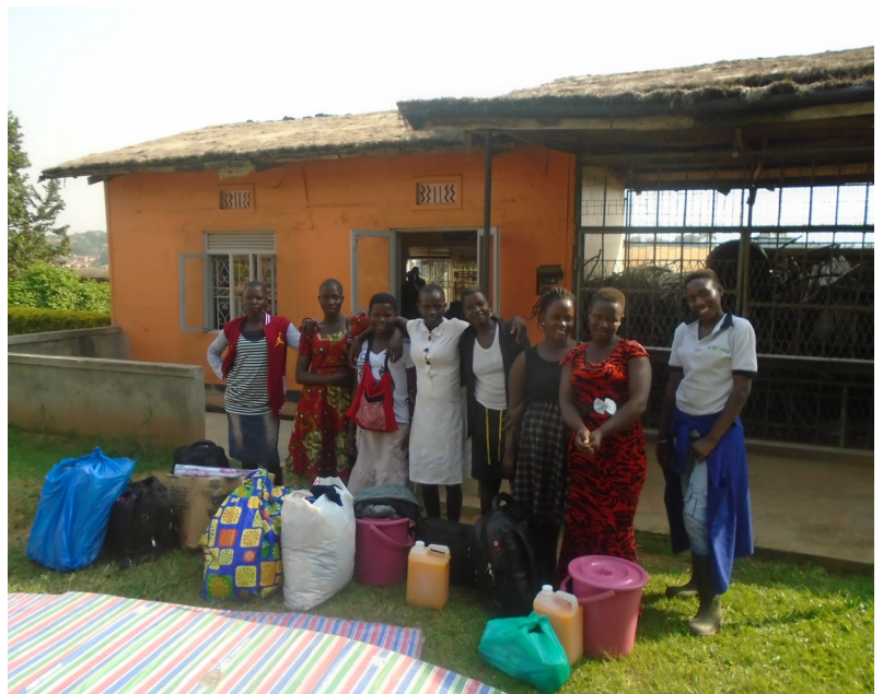
new group at AgroMax

Schools open early February and the young mothers are going back to school excited for a new chapter in the New Year.