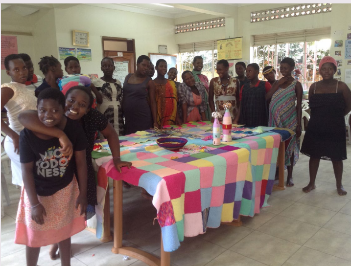
girls with some of the crafts made

May God's name be glorified in all things you do and may He reward the work of your hands.