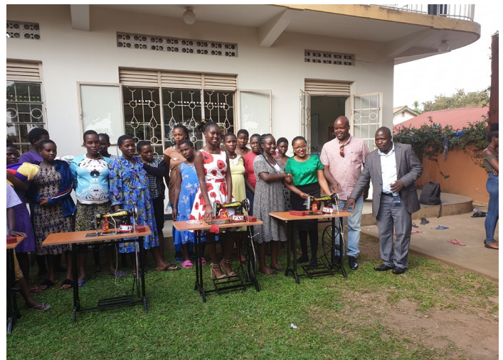
4 sewing machines donated to the center