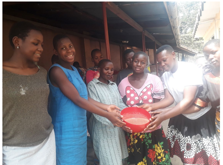
some of the filinda sauce made in catering