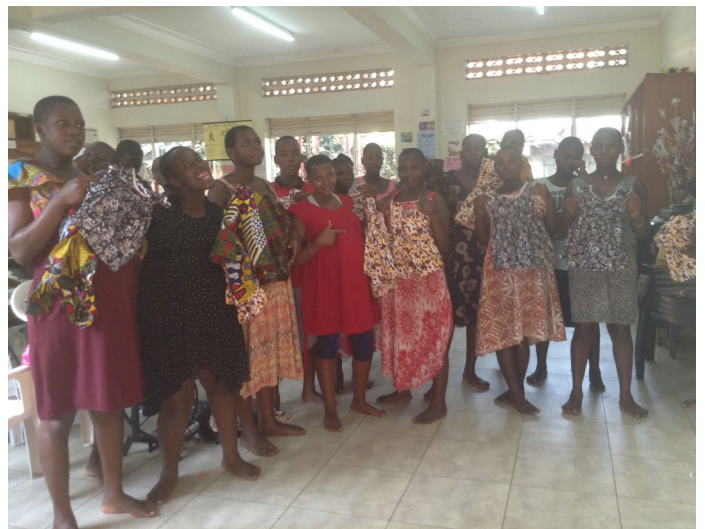
tailoring class with some of the items