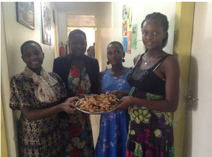
some items from the catering class