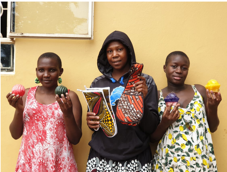
girls with some of the candles