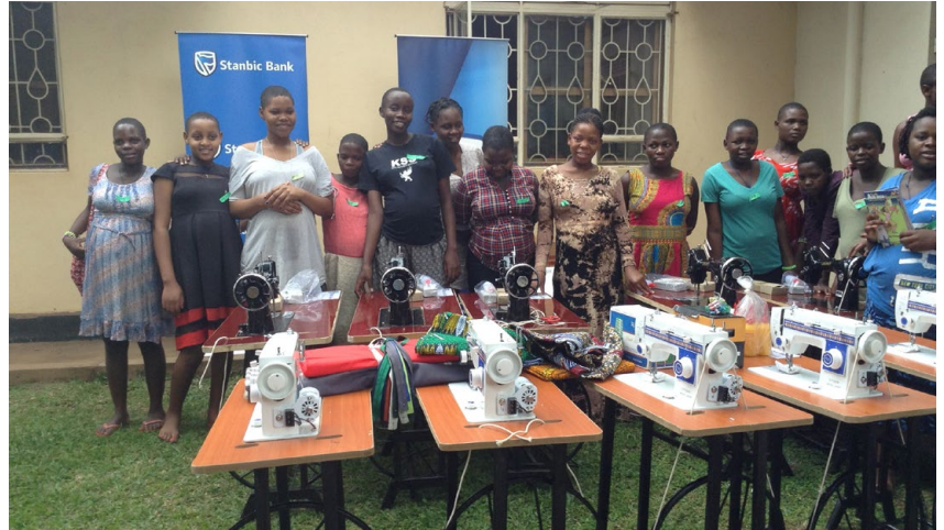
machines from Stanbic

We received a generous donation from Stanbic bank of 10 sewing machines. These will go a long way in boosting our tailoring and Art and Crafts Vocational classes. The team at Wakisa is grateful to Stanbic Bank for this generous donation to the vocational classes.