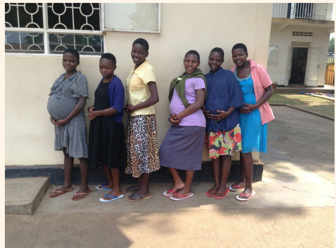
the youngest group of girls