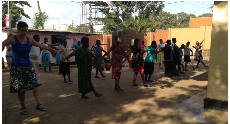
the girls doing some exercises

The infant care class centred on Breast feeding and Hygiene while the life skills class centred on Life lessons learnt while at Wakisa.