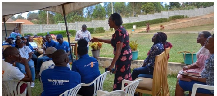
wakisa director addressing stanbic team