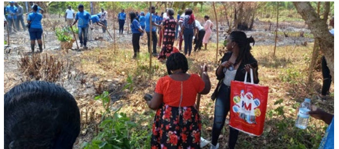
stanbic team planting trees