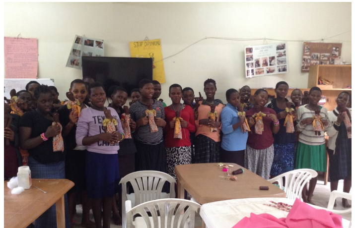
the girls with dolls made

Your support will continue to give skills and life to the mums and their babies. Blessings