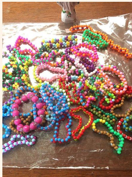
bangles from crafts

We have had 5 new admissions this month and the new girls are coping with the new changes well. They have all been examined and we have tentative due dates for all them. 2 new mothers have gone back home and we are pleased that they are settling in well.