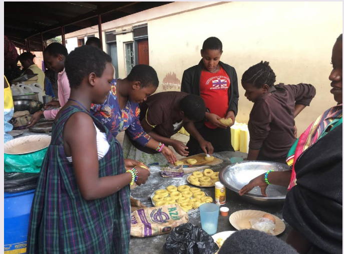
making doughnuts in cookery class

Morning devotions have discussion groups which encourage full participation of all the girls. The girls are enjoying the Alpha course which they are learning using visual aids. The Health, Pregnancy and Infant care class have helped the young girls prepare themselves for the delivery of their babies.