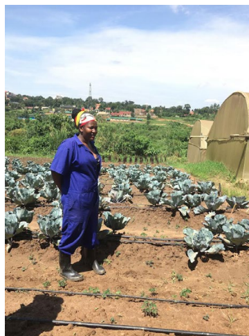
displaying her project

Visitation days at school are on 14th and 15th July and we are looking forward to seeing how well the girls are progressing at school.