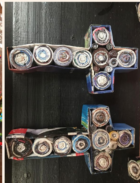
crosses from crafts