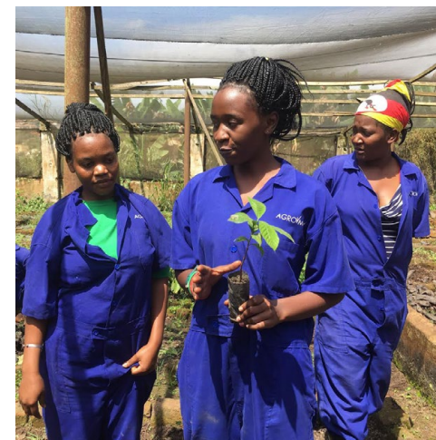
girls showing what they've learnt