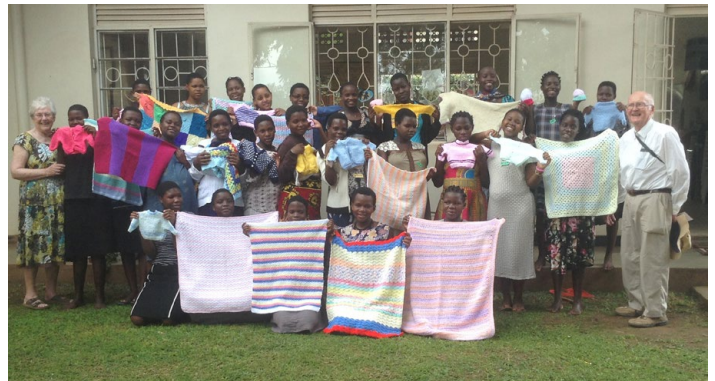
the girls with some of the gifts