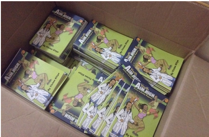
the Youth AIM High Pamphlets