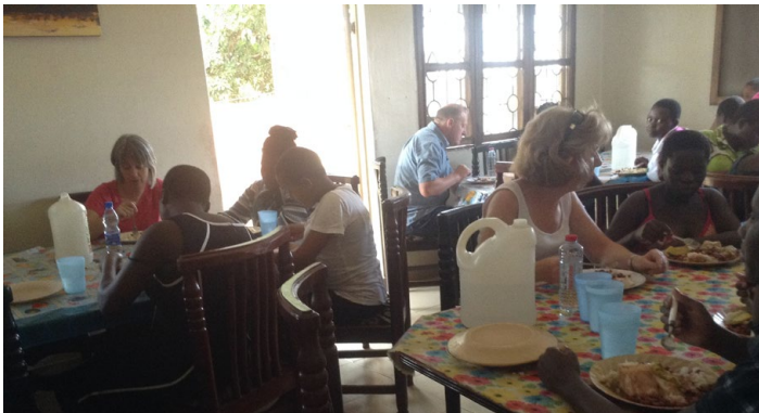
some of the visitors at lunch

Your support will continue to give skills and life to the mums and their babies.