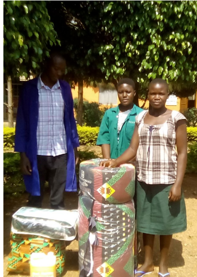
Faith at School