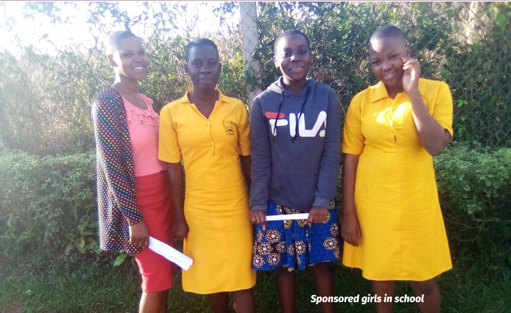
Sponsored girls in school