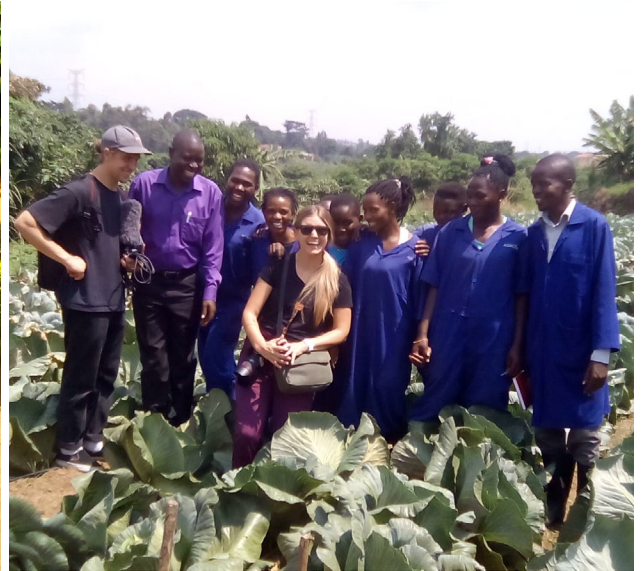
Girls at agromax with Visitors from Hope venture

May the Lord reward you for partnering with Wakisa Ministries to save the physical and spiritual lives of the vulnerable young mums.