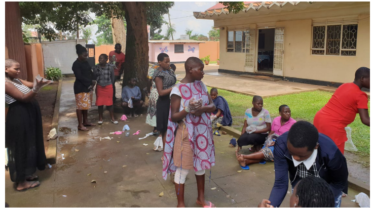
bonding moment around the center

We praise God that through you we have been able to repaint the structure. The next time you come by, the building will look different. We have been working alongside KCCA to file all the girls' records with the courts as a measure to seek justice.