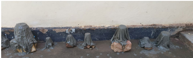
DIY project, crafting vases

The Cookery class made dishes like; steamed vegetables, vegetable rice and Luwombo (steamed stew in banana leaves). The girls are enjoying the knitting machines and have been making knitted items for their babies.