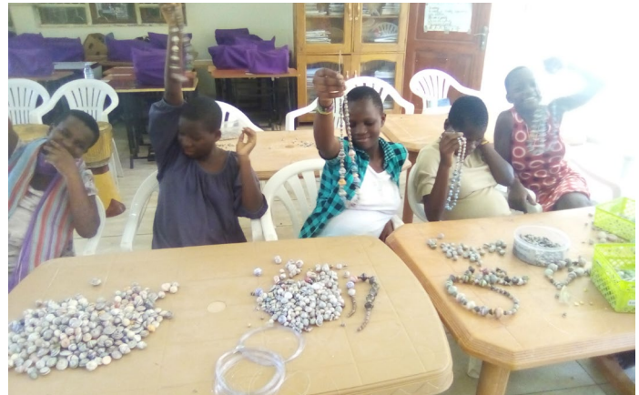
making necklaces in crafts class