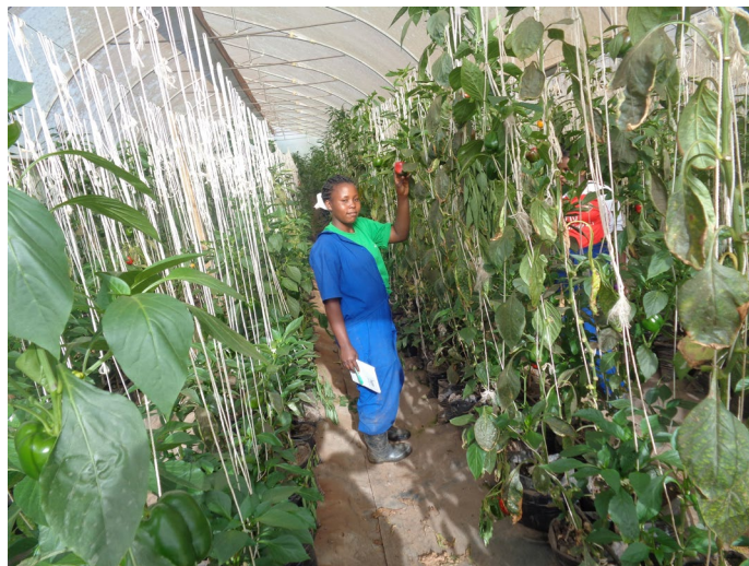
green house for sweet pepper