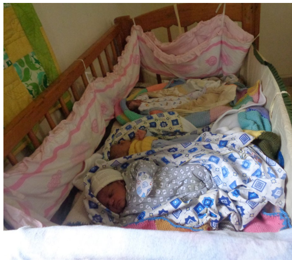
3 of the babies in the cot