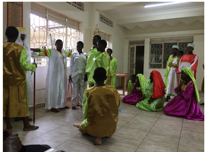
some of the scenes from the play