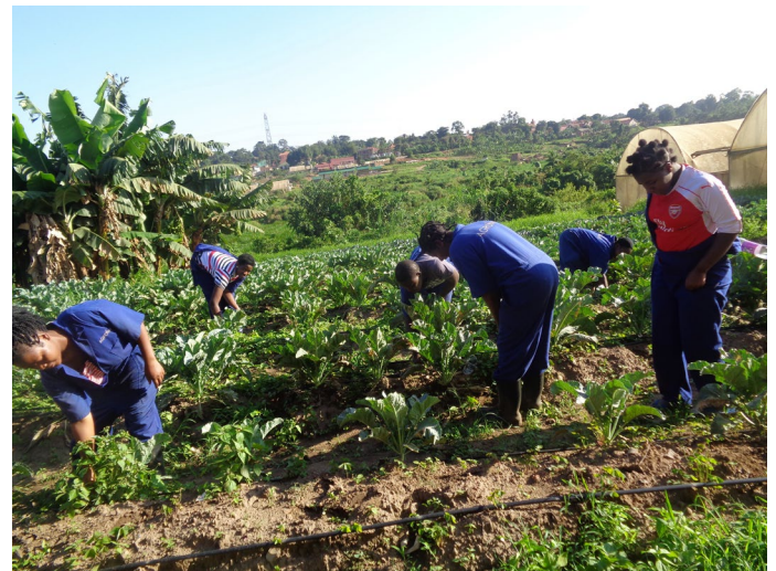
open field growing sukuma wiki