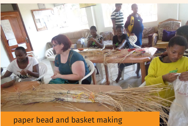
paper bead and basket making