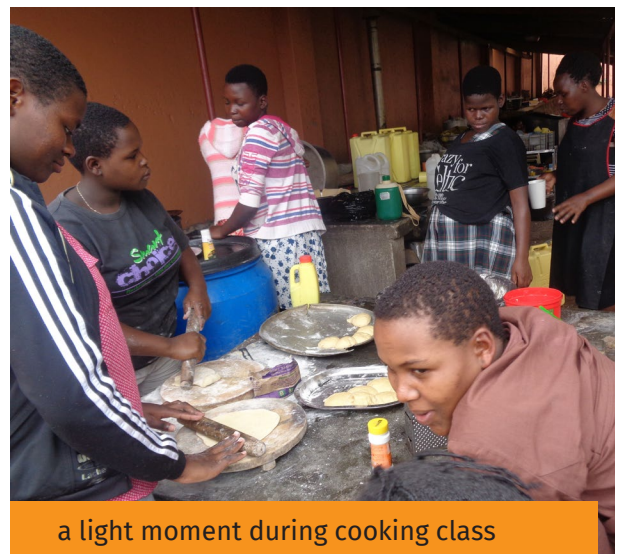
a light moment during cooking class