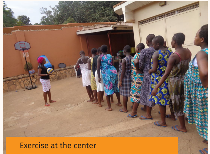
Exercise at the center

Girls has been taught that being a teenager with unwanted pregnancy can put enormous stress on a young girl and her family. However, once the pregnancy is confirmed the important thing is to support the young woman and to help her to make the wisest choice for her at this time.