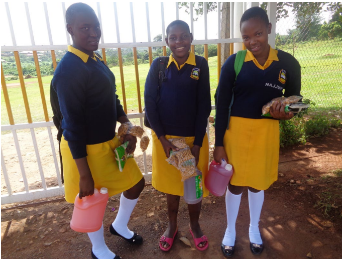
girls at school under sponsorship

The schools visited were; St Micheal, Agromax and Buloba Primary and High School.