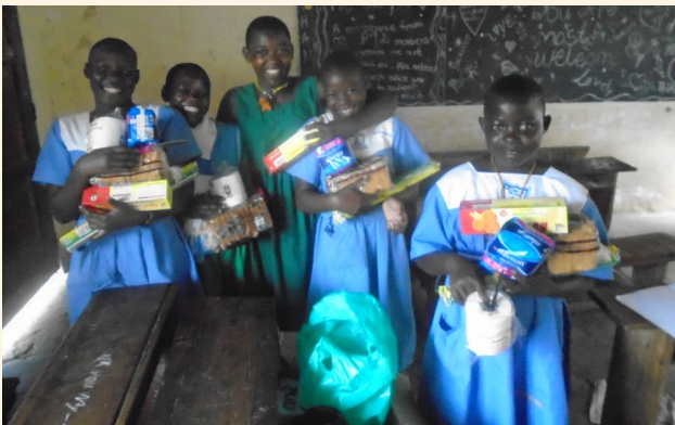
visitation day at the school