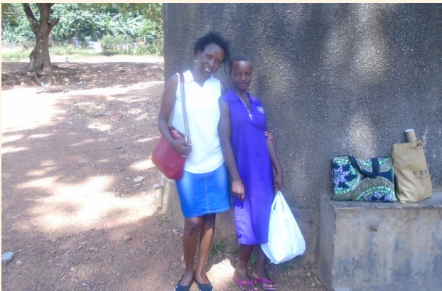
Violet at school visit

The schools are: St Micheal Secondary School, Buloba Primary and Secondary, Namirembe Infant Primary and Agromax.