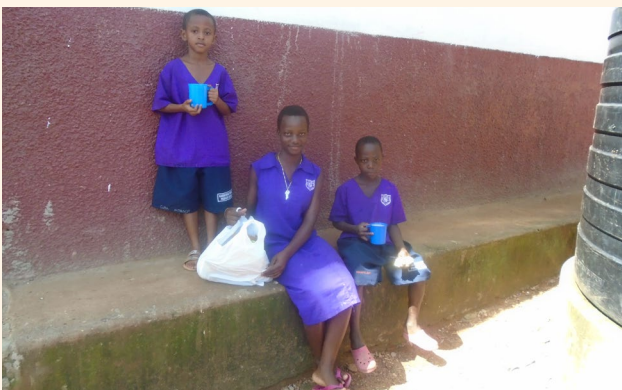
violet at school during the visit