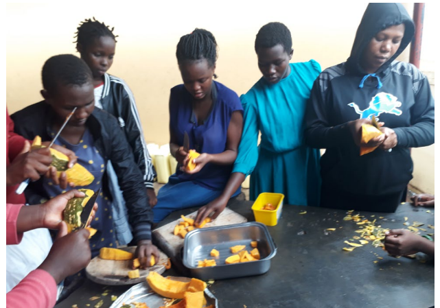
making pumpkin soup