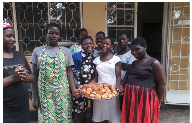
half cakes made in catering class