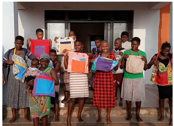
some pieces from the tailoring class