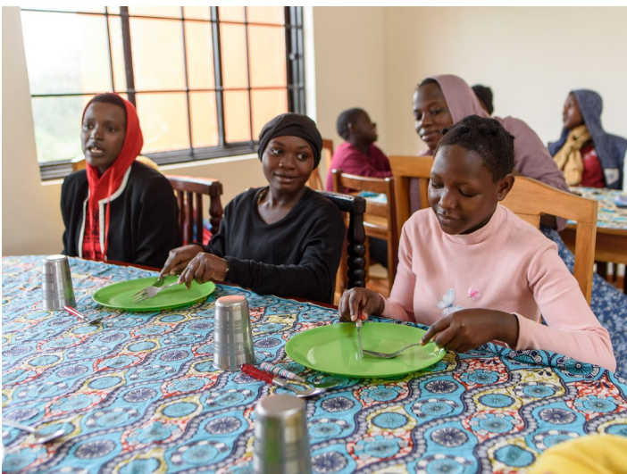
how to use a fork and knife