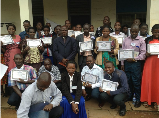
Training in Mbale on Trauma Counselling

Wakisa Ministries organized and conducted a 3 Day Trauma Training for 58 teachers in Mbale. The training was very successful as we received both male and female teachers. We realized there several female teachers who had been sexually abused when they were young .