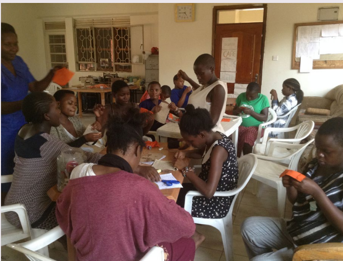
crafts class at the center

Morning devotions have discussion groups which encourage full participation of all the girls and ensure that they are drawn to Christ.