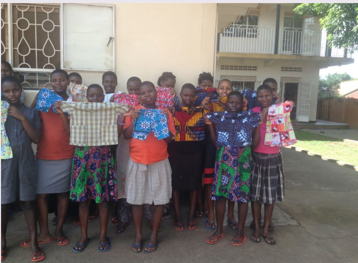
the girls with some of the products of tailoring class