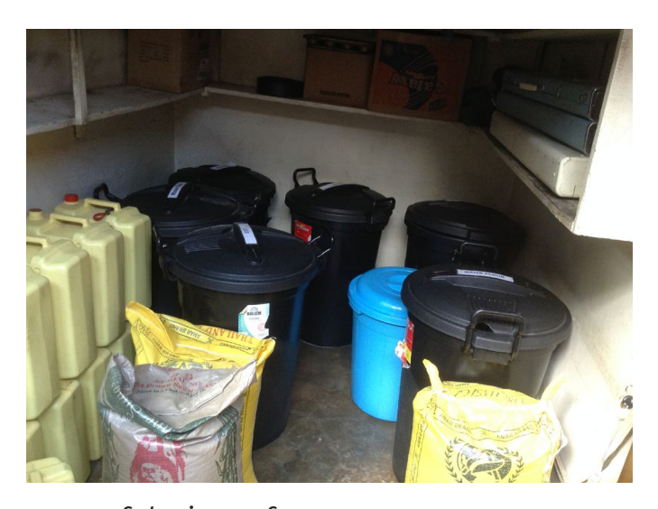
some of the items for use

The 8 girls who have also been visited, a few items of toiletries and snacks were taken to them as well.