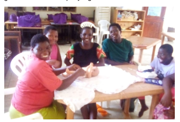
girls in infant care class