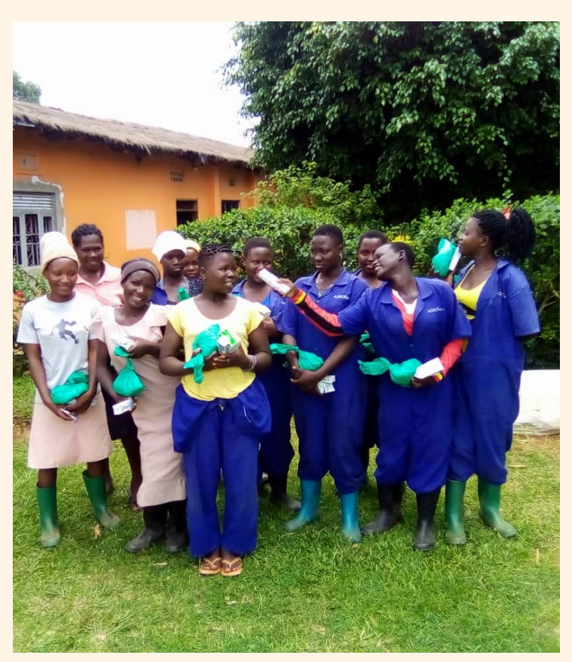
girls visitation at agromax

While the young mums under sponsorship are 36, the 27 in formal education are currently home during the lock down and 8 girls are attending Agricultural skills training at AGROMAX Institute where they are learning about planting, entrepreneurship and other services offered at the institute.