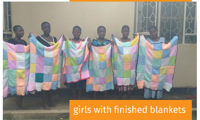
girls with finished blankets