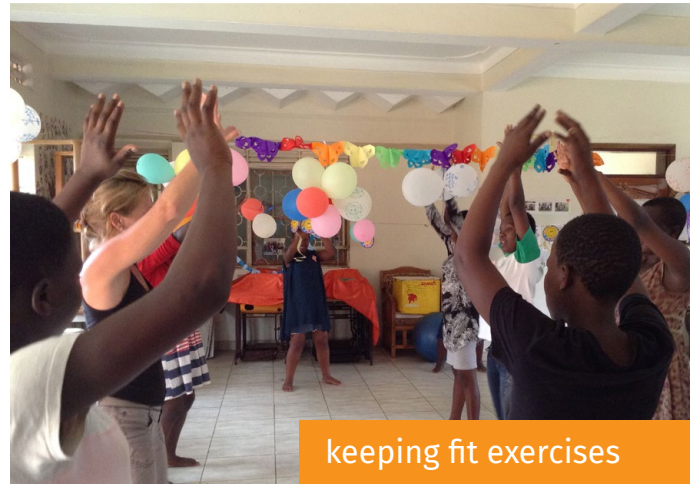
keeping fit exercises