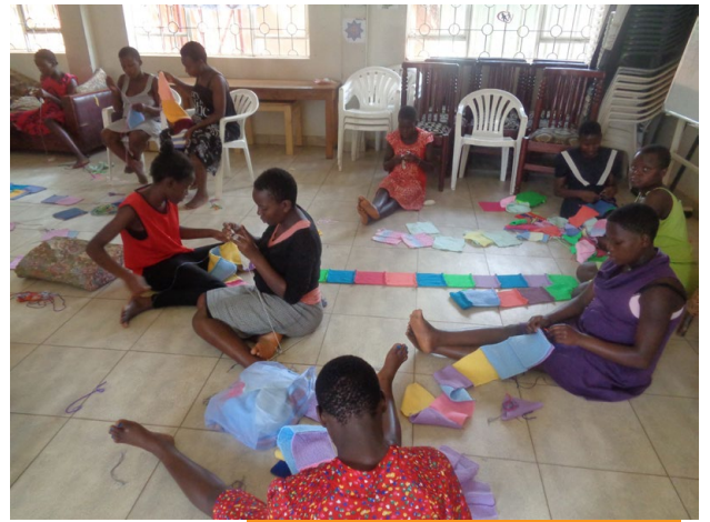
girls making bed covers

The candle class has been an active class with beautiful candles made by the girls. They have all learnt the practical and theory making practices of candle making. The dry candles are packaged and put in the gift shop for purchasing.