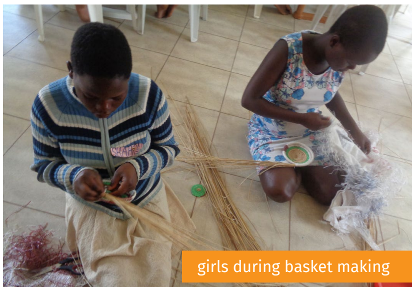
girls during basket making