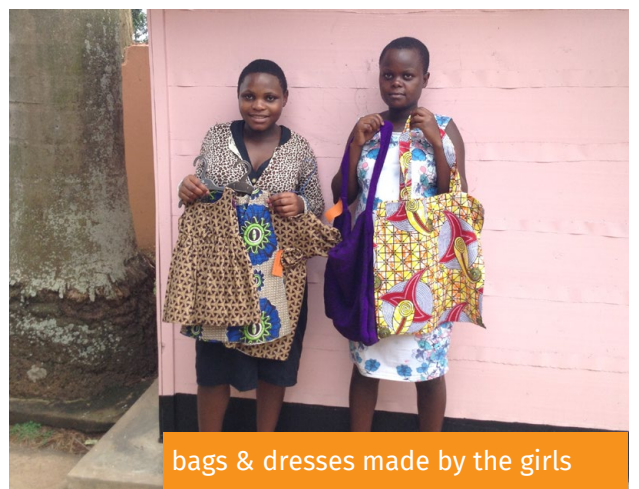
bags & dresses made by the girls