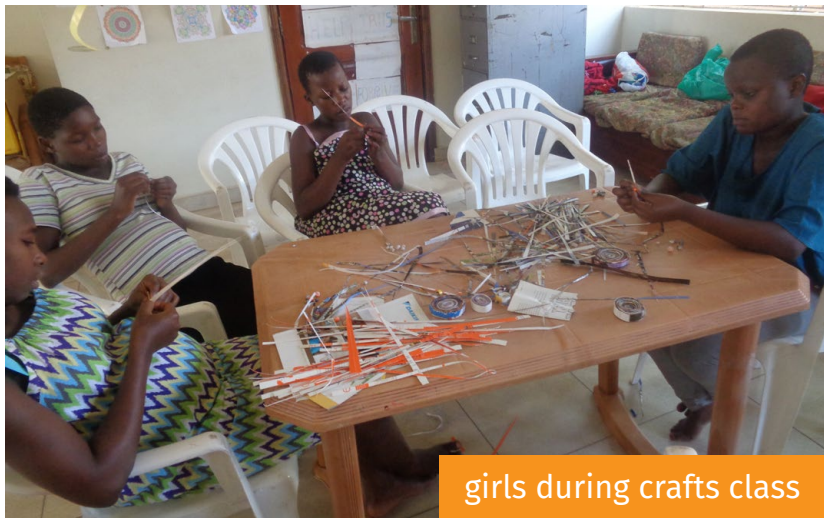
girls during crafts class