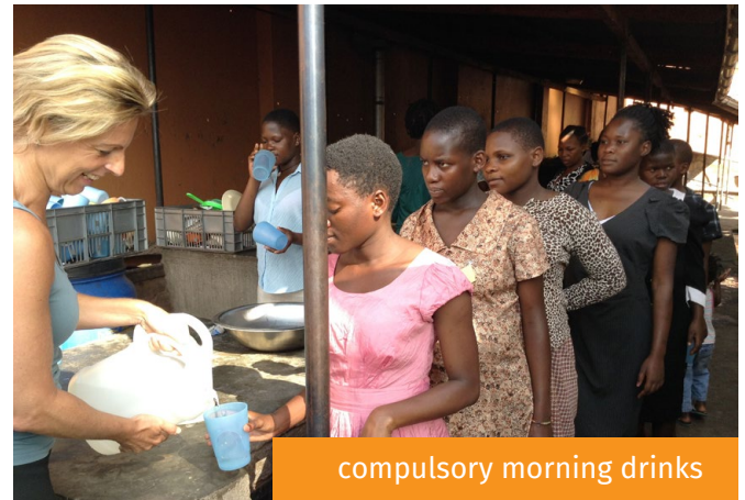
compulsory morning drinks