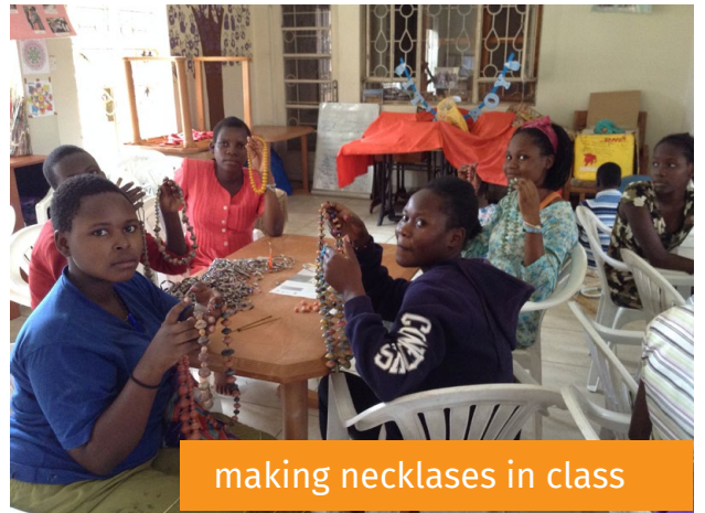
making necklaces in class