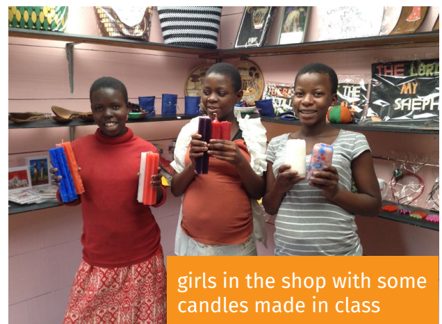
girls in the shop with some candles made in class