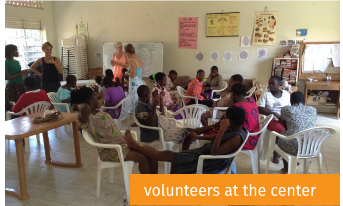
volunteers at the center