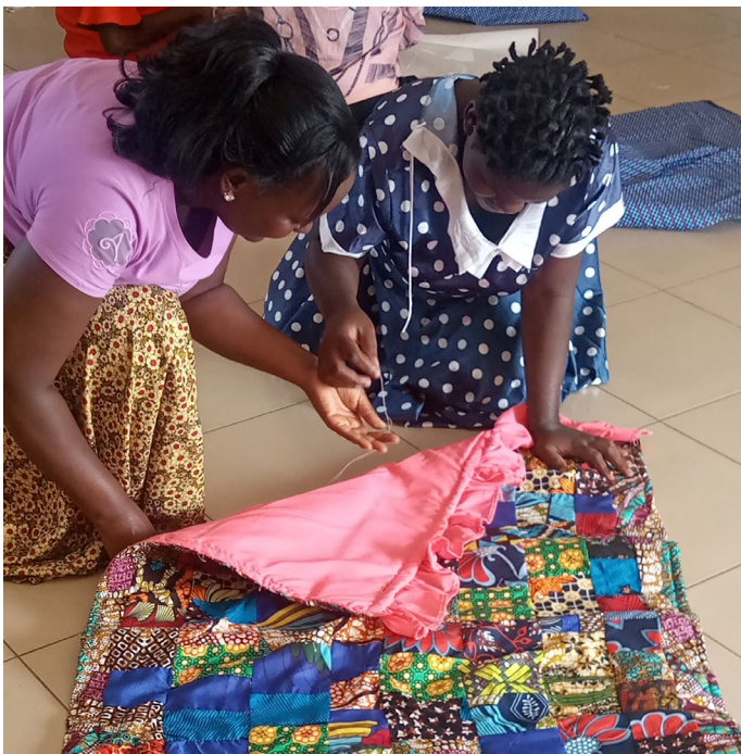
tailoring at the center