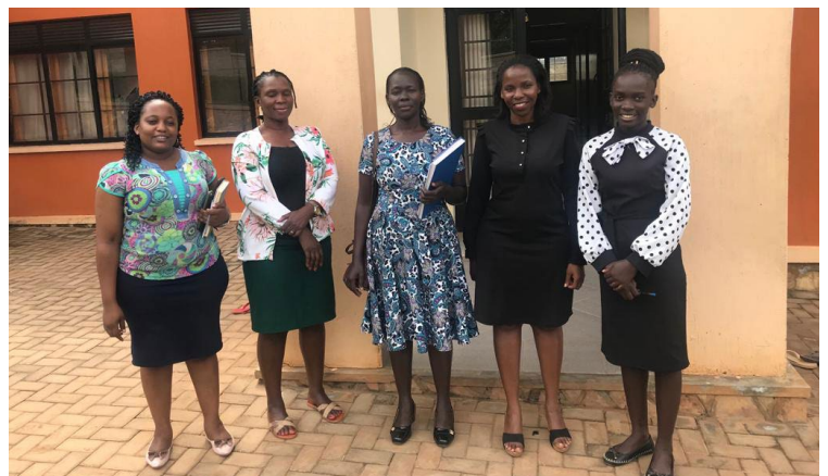
ministry visitors to the center with some staff