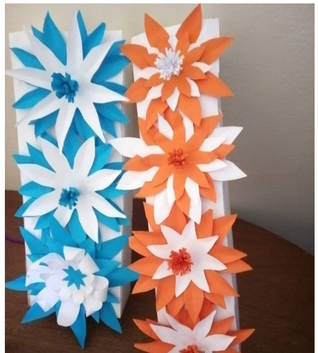
paper decorations made by the