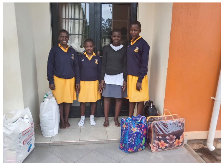
girls back from school for the december holidays