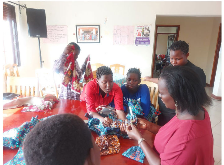
knitting at the center