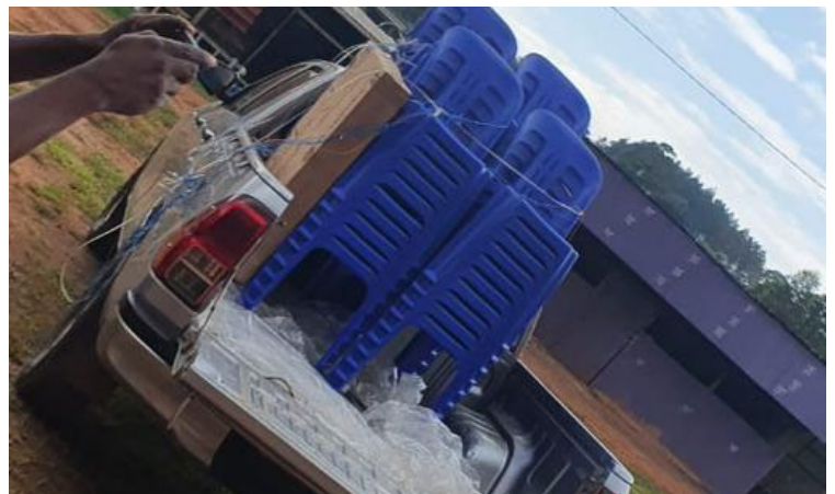
chairs donated to the center

Ministry Of Gender, labour and social development together with the probation officer paid a visit to Wakisa Ministries.