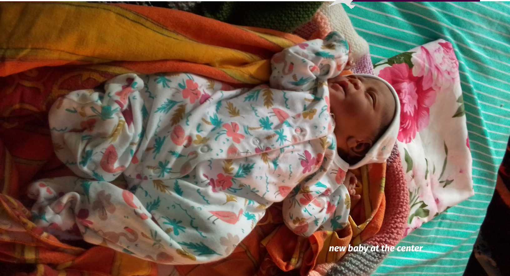
new baby at the center