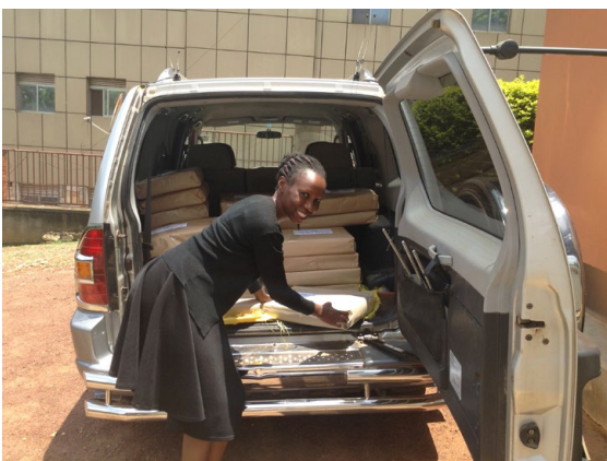
AIM books being delivered