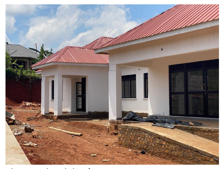
the completed domitory

What a glorious thing to enter a new place with new born again young mothers for God.