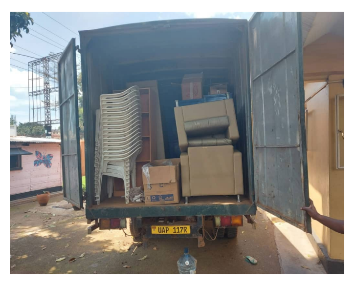
packing and moving wakisa belongings from the old center