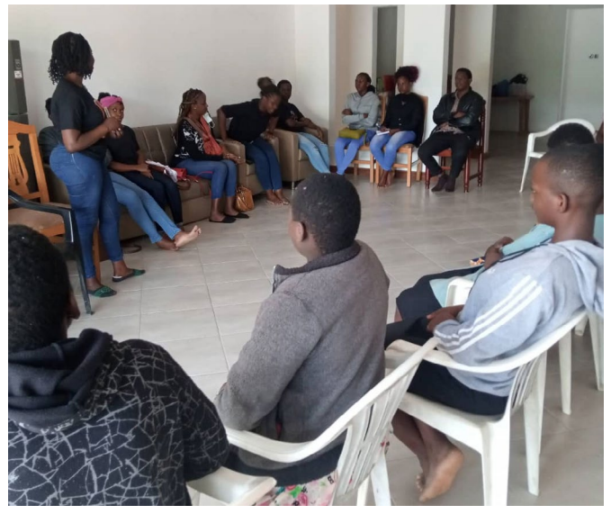
light moments at the new center with some visitors as well