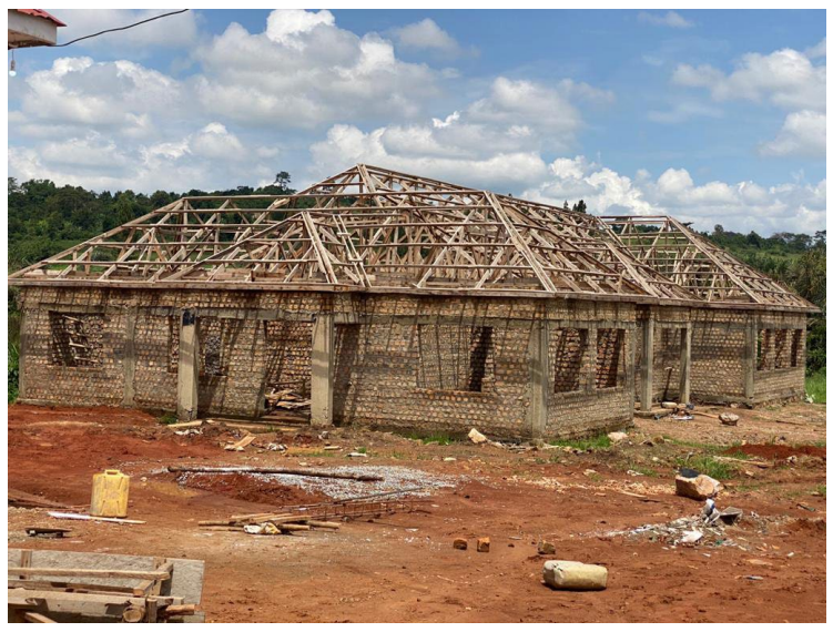
administration block still under construction