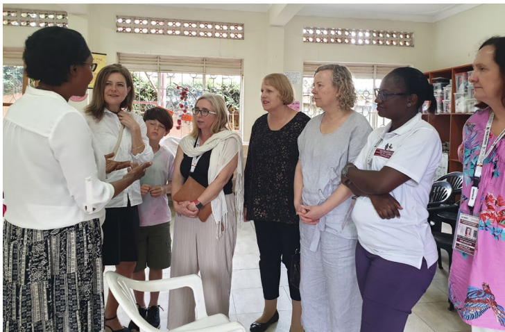
Australian team at the center

Incidentally Australia is where I had been this month in a fundraising drive organized by WorldShare! It was interesting for the girls to learn that other continents are also affected by teenage pregnancies. The girls later demonstrated how to they make candles.