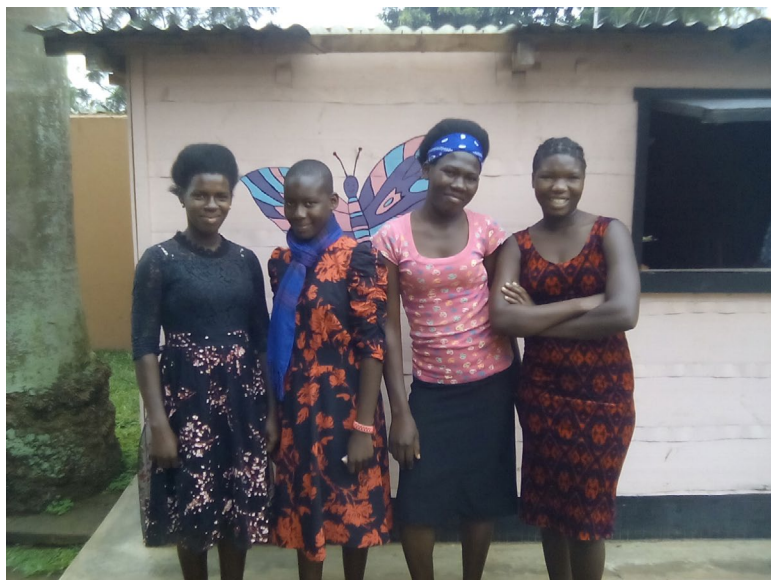
girls studying at agromax