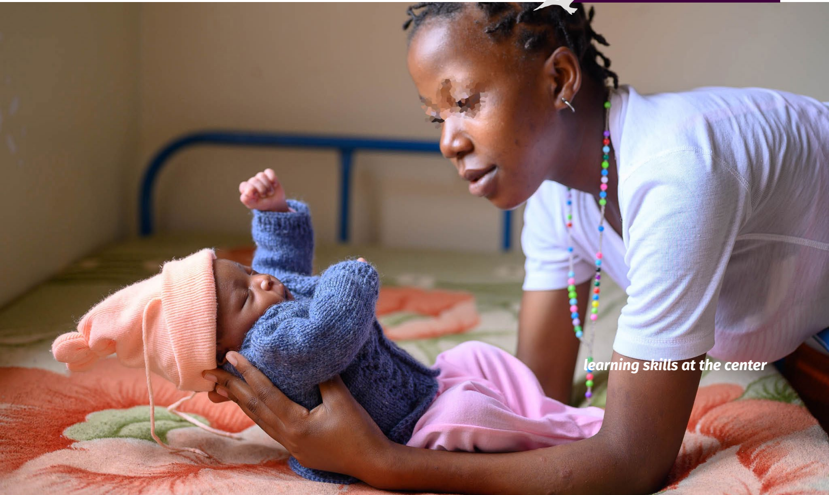
learning skills at the center