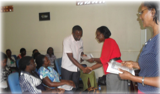
TEACHERS RECEIVING CERTIFICATES AFTER THE TRAINING