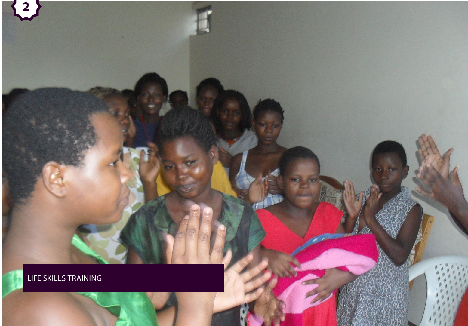
LIFE SKILLS TRAINING