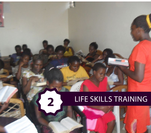
2 LIFE SKILLS TRAINING