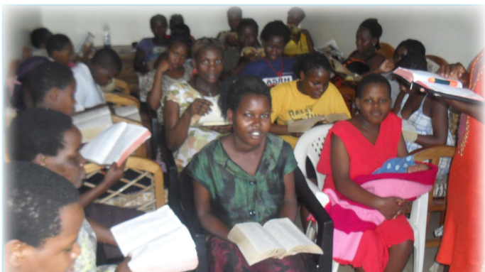
LIFE SKILLS TRAINING FOR THE GIRLS

In this same month, we successfully conducted two workshops. The life skills training sponsored by Church Mission Society (CMS) UK took place 31st of March to 2nd - was a three day's workshop. Some of the 40 girls attended were with their babies. It was in this workshop that almost all girls openly revealed the dire stress and trauma they had experienced as they grew up with parents or guardians.