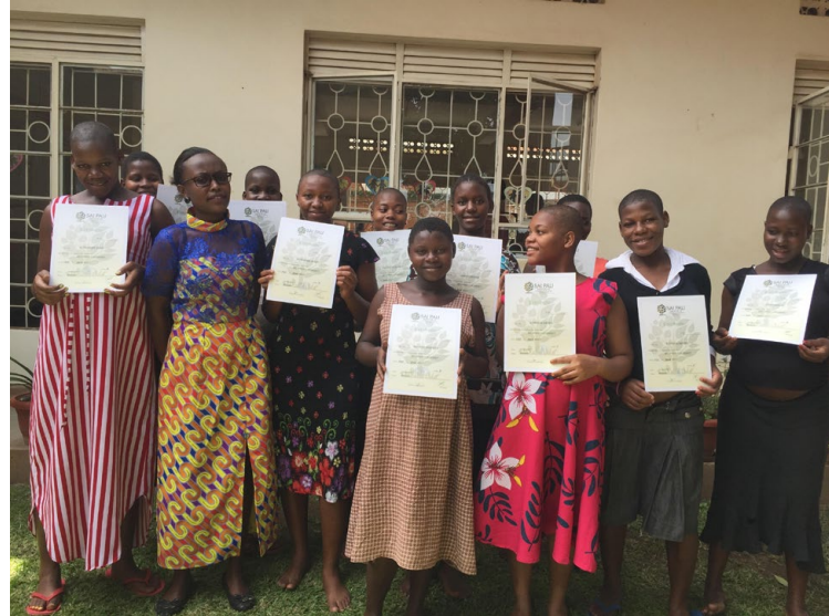
Certificates from Sai Pali

The teenage mothers who were studying Computer at Sai Pali – Institute of Technology and Management got certificates for the training they received.