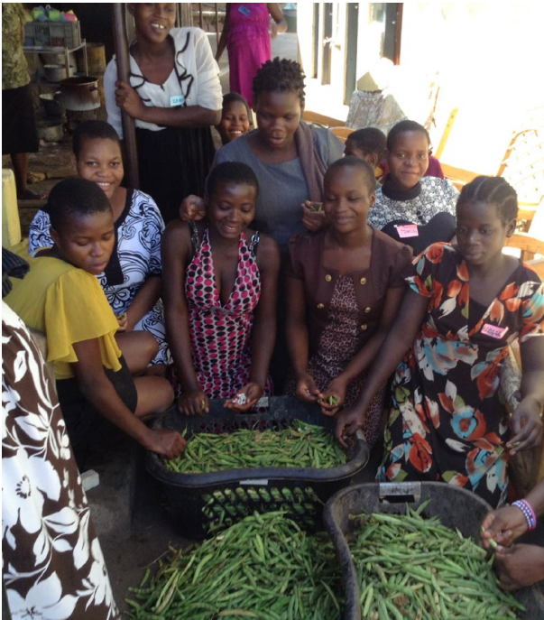
produce from the garden