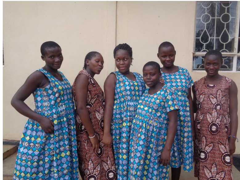
Tailored maternity dresses