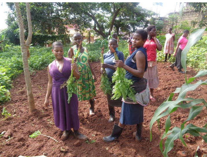
Girls in the garden