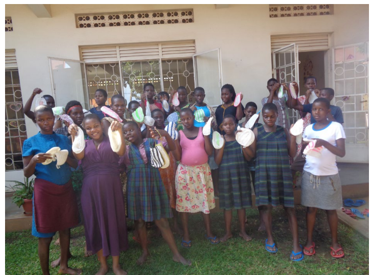
Products of the knitting class