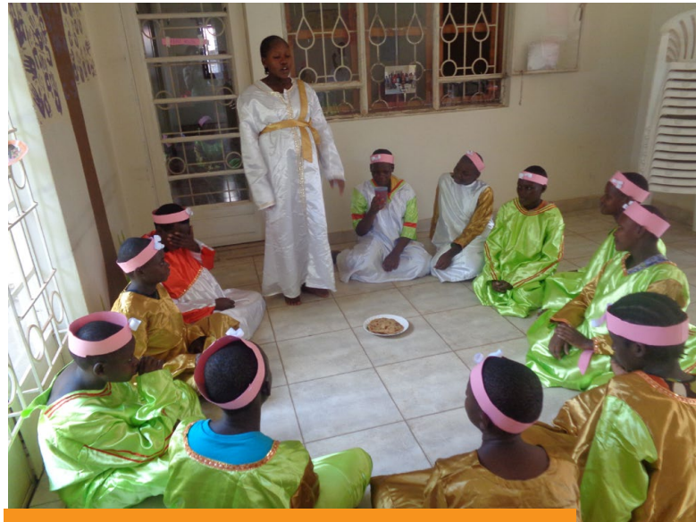
Easter play presented by wakisa girls

We received visitors from various walks of life. When different people come to visit, it is such a huge sign of hope for the girls as they realise they are not completely stigmatized by the community.