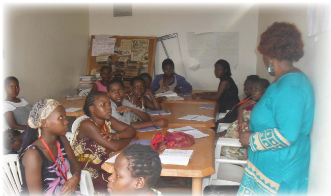
AGRICULTURE THEORY LESSONS

Thanks to Worldshare for the vocational skills training.