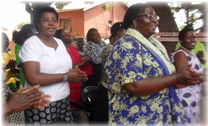
LADIES FROM KAMPALA DIOCESE

We had a service with the girls last Sunday in the ground floor room when 30 Christian women visited us from Kampala Diocese. One of them, a lady priest conducted the service. They were all in tears when they saw these young pregnant girls! The group donated rice, wheat flour, sugar and clothing that day. With the collections that Sunday we managed to buy 11 bags of cement for the ongoing plastering of the upper room