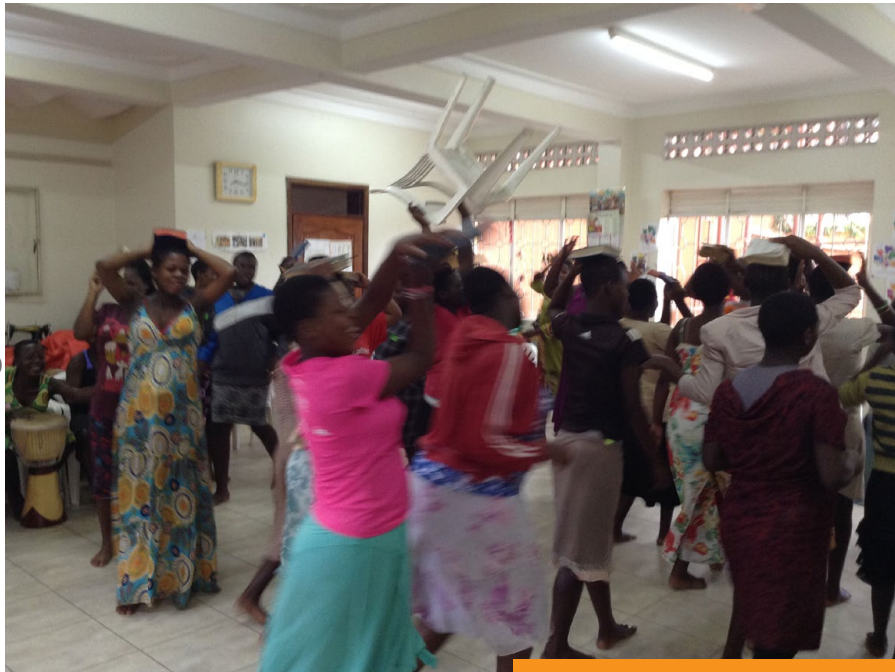
Learning at Wakisa

group of wayward girls and a prostitute hired 15 of them to steal from men .She was 13 when she her sister were hired and could go to night clubs dressed up in crop tops and long wigs .They could lure men and drug these men by secretly dropping a tablet in their glass which this prostitute gave them before they could go anywhere.