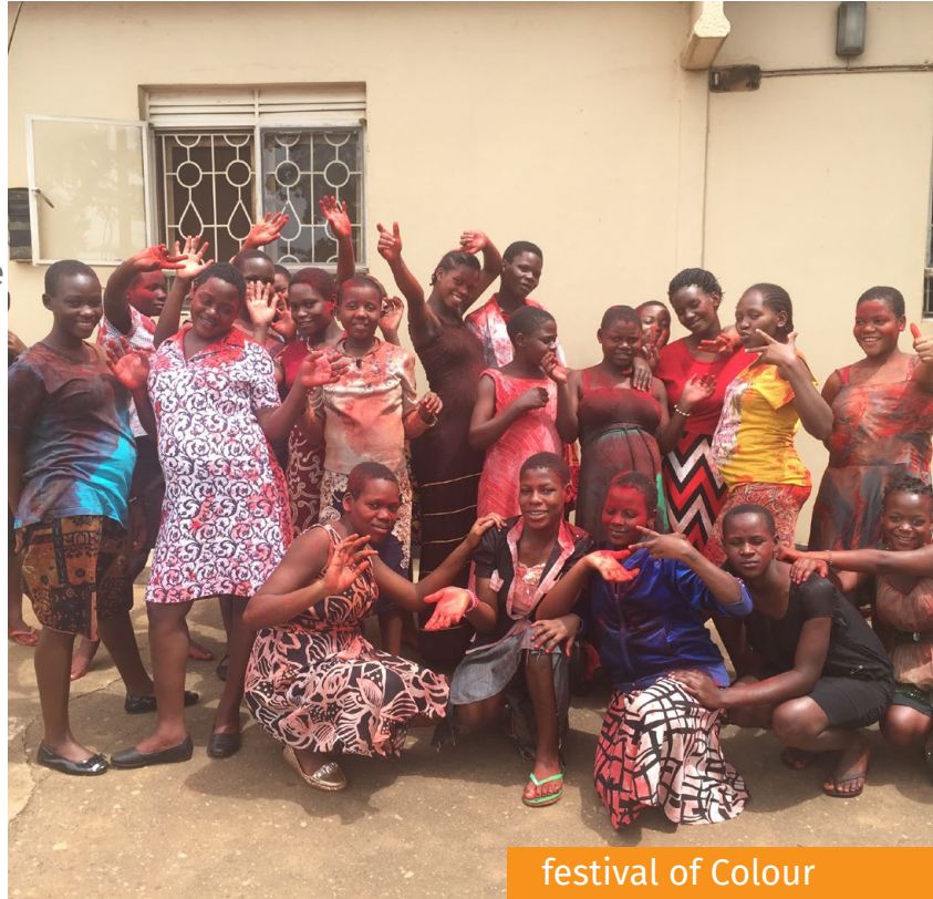
festival of Colour

Sai Pail Institute of Technology and Management in our neighbourhood offered 20 girls access to basic Computer training, the same institute hosted the festival of Colour which the girls attended and enjoyed.