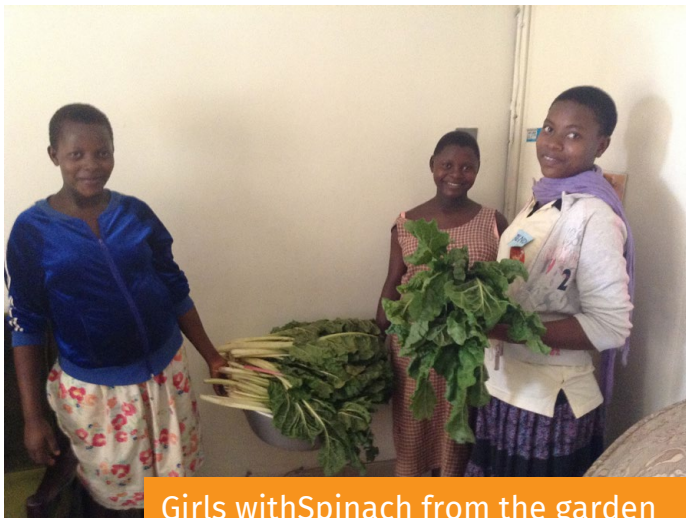
Girls with Spinach from the garden