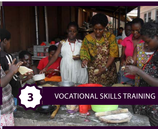
3 VOCATIONAL SKILLS TRAINING