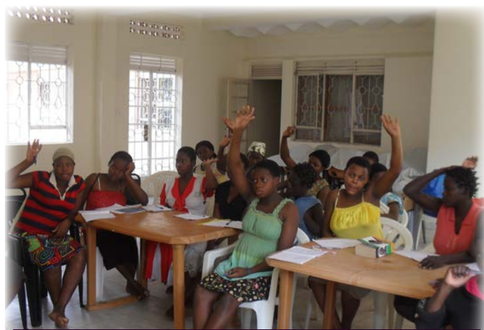
PREGNANCY & INFANT CARE CLASS