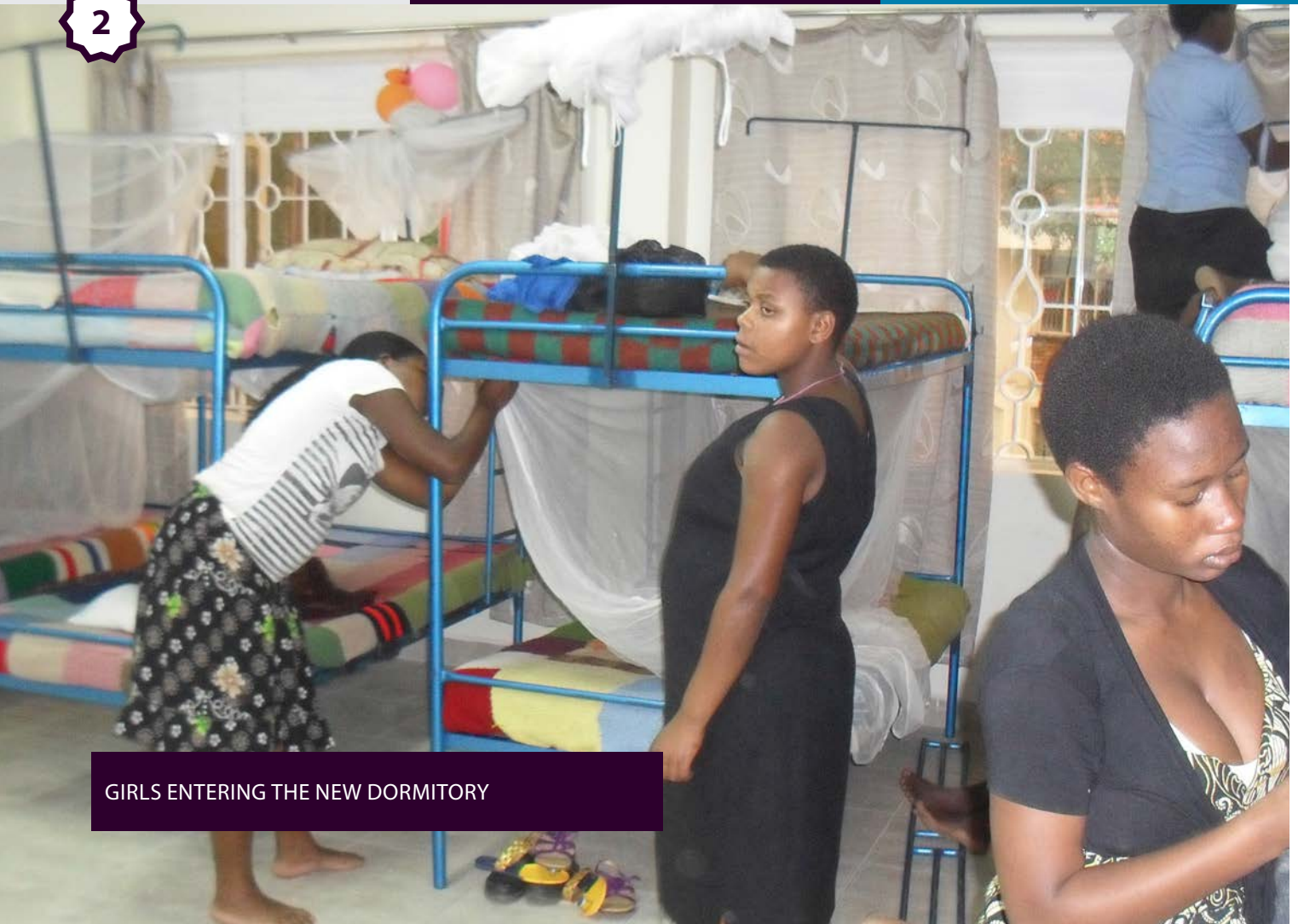
GIRLS ENTERING THE NEW DORMITORY