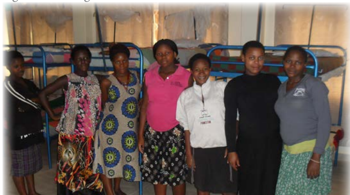
GIRLS IN THE NEW DORMITORY

Though all the finishing work was paid and done by the team from Ireland, the building engineer is still claiming 10,000,000 Uganda Shillings as labour from Wakisa Ministries!