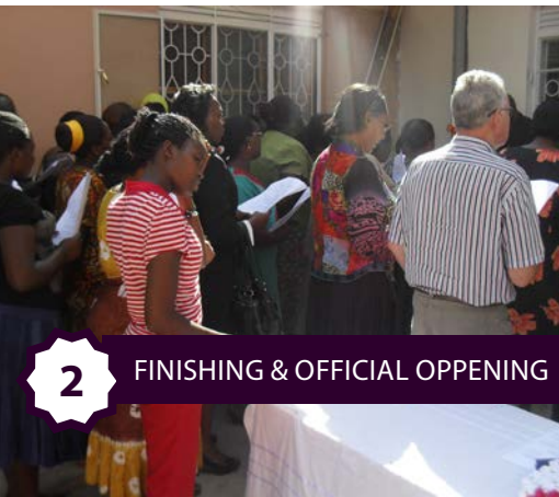
2 FINISHING & OFFICIAL OPENING